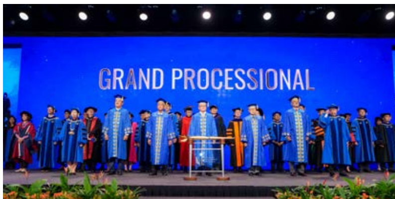
The Opening Ceremony at SMU Commencement 2025.

These graduates join the over 40,000 alumni who are now leaders and changemakers across business, government, social impact, and the arts.