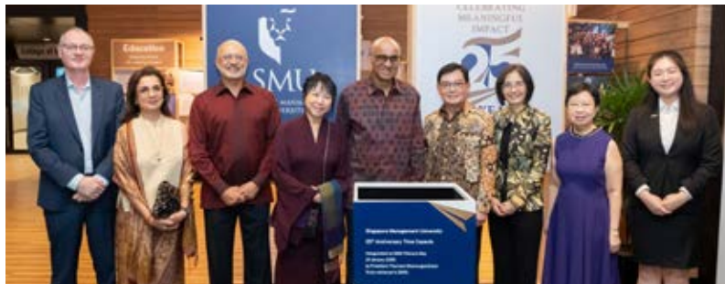
SMU Patron's Day 2025.

Besides the party, there was the largest-ever gathering of SMU Makers, a vibrant assembly of