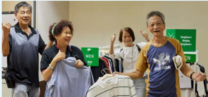
Beneficiaries selecting preloved UNIQLO clothing from NHN redistribution centre.

This was the first-of-its-kind, data-driven study, conducted in